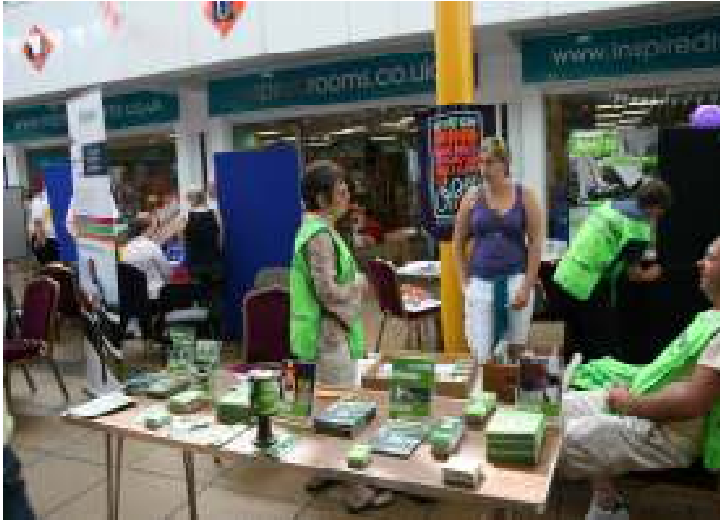
Samaritans of South Devon volunteers enjoying the day