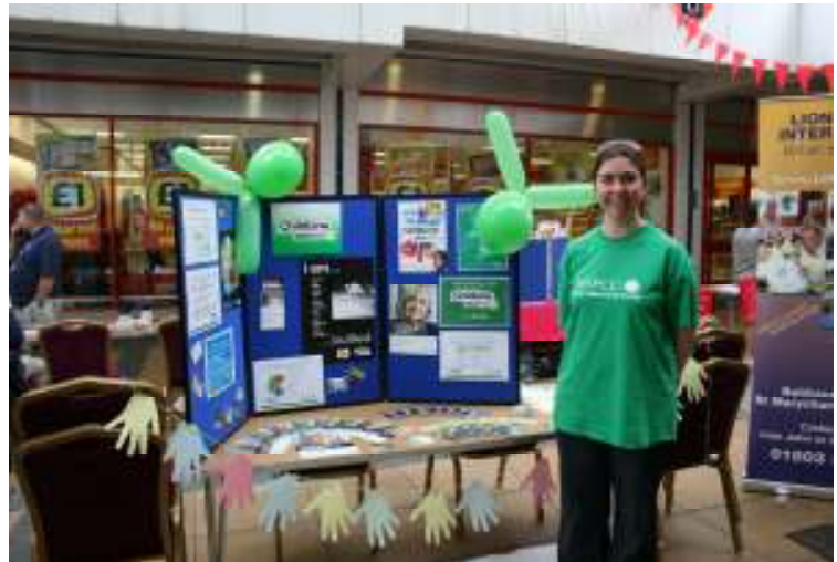
Childline Southwest representatives spreading the message about keeping our children safe

Volunteers Week is a National Celebration of all things voluntary and here at CVA Torbay we organise and coordinate an annual event to mark the occasion. 2010 was an extremely successful occasion with more than 24 local community and voluntary groups sharing their knowledge and expertise with members of the public. We were so pleased with the outcome that we are now looking at the possibility of expansion of this event making it bigger and better for all concerned.